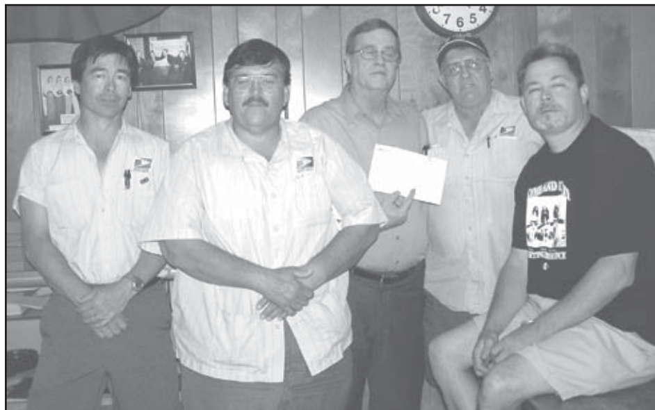
Eastland Station collected $600 for COLCPE to take to Washington.